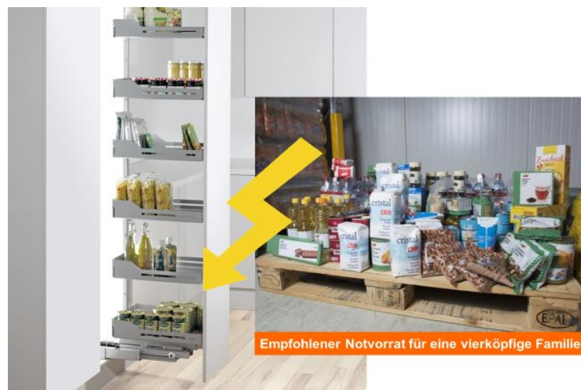
Figure 3: Recommended emergency stock for a family of four (Andreas Münch, MGB)

This is precisely why emergency stocks are of high relevance from the point of view of Migros. However, emergency stocks for a week are usually no longer possible today due to the size of the apartments (see Figure 3). An additional difficulty is the change in consumer behavior due to demographic developments: The increasing aging of the population and the rising number of single or two-person households automatically promote the demand for small packages. If instead of a five-kilo pack of carrots a single packed carrot is bought, according to Andreas Münch, this makes stock-keeping enormously difficult.