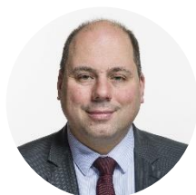
Mauro Tuena President SPC-N, National Councillor (SVP,ZH)