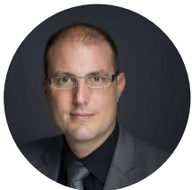
Florian Schütz Delegate of the Confederation for Cyber Security