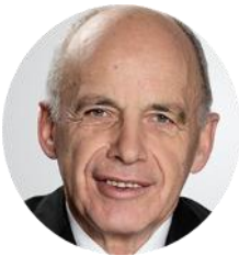
Ueli Maurer Federal Councillor Head FDF